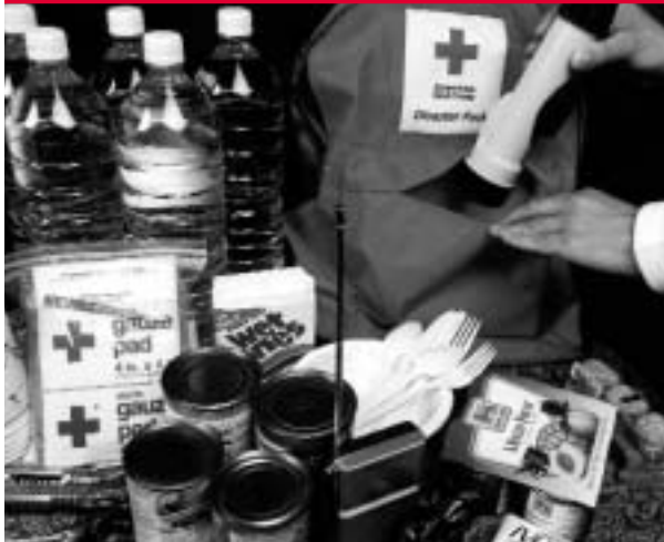
A disaster supply kit, with items like those shown and a radio and extra batteries, is an essential resource in times of emergency.